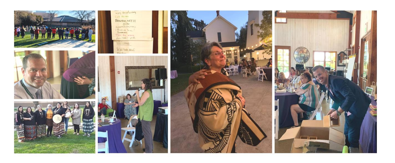
Through the years